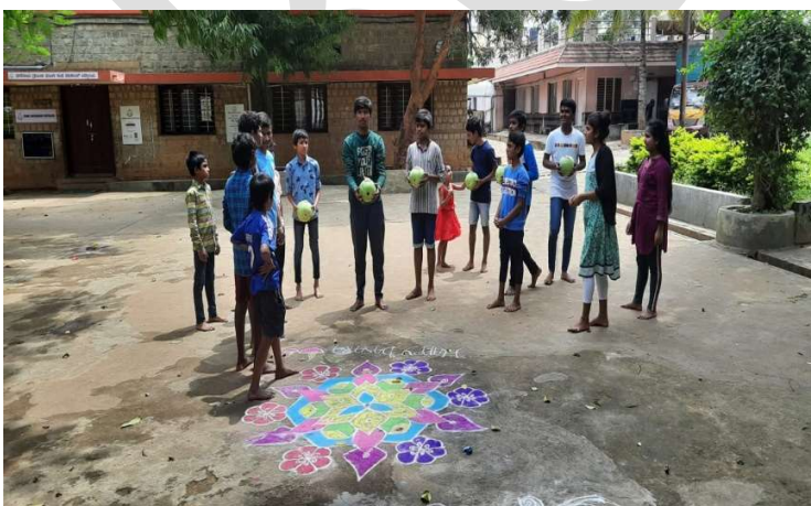
Dusherra and Depavali was celebrated