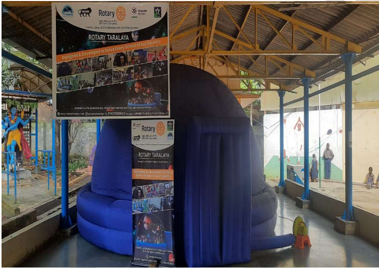
Taralaya – Planetarium on wheels