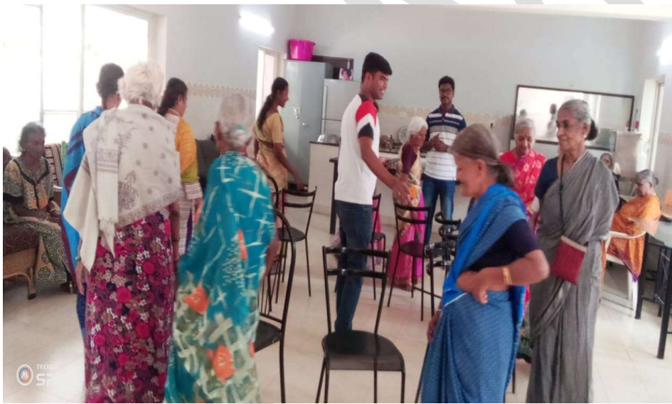
Fun activities – Musical chair