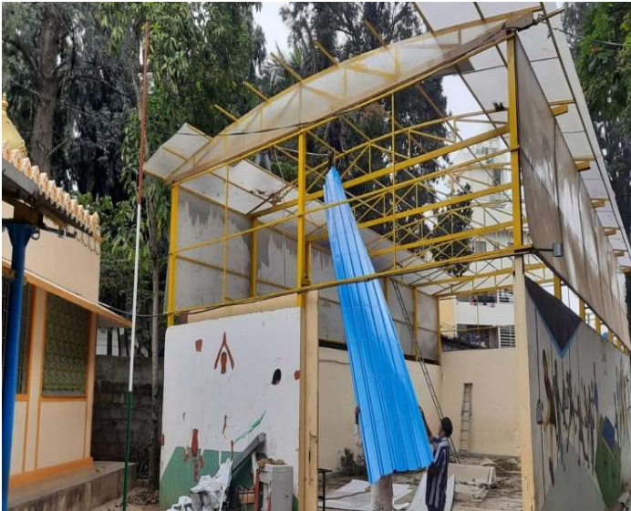
Indoor play area repair work