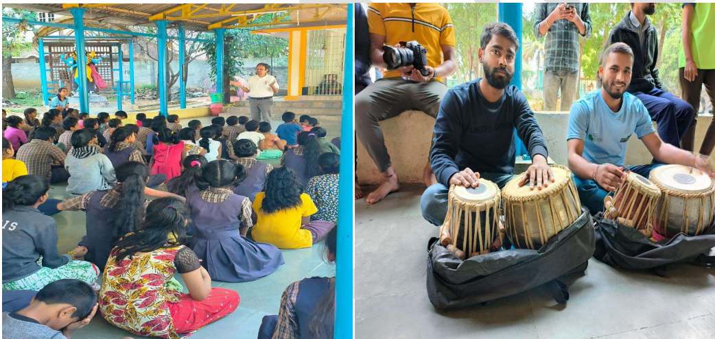
Old students visit BGMS on Sundays and participate in the Balasabha

Bala Sabha – Every Sunday between 10 TO 1pm