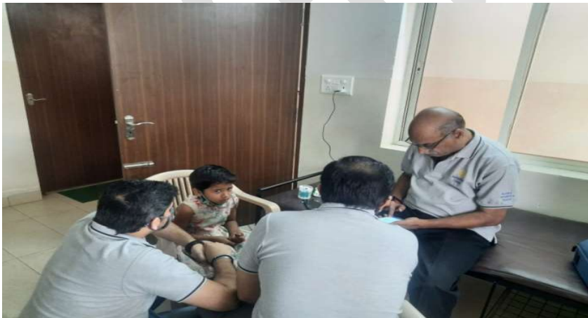
Hearing test for children