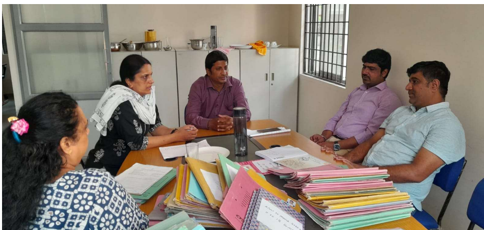
DCPO (District Child protection officer) inspected Boys hostels and files of children

Regular inspections conducted by DCPO and CWC.