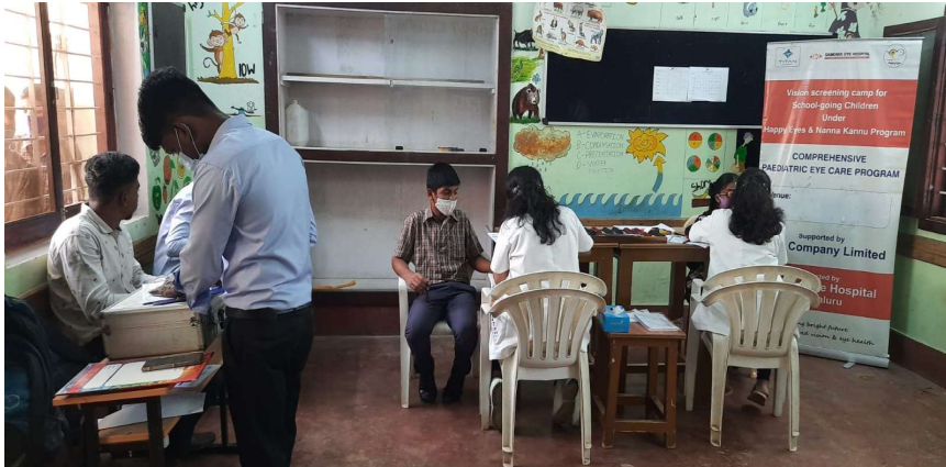
Eye screening camp by Shankara hospital