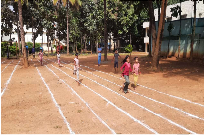
On the occasion of children's day painting, dance and essay and sports competitions were held at BGMS

Bala Sabha – Every Sunday between 10 TO 1pm