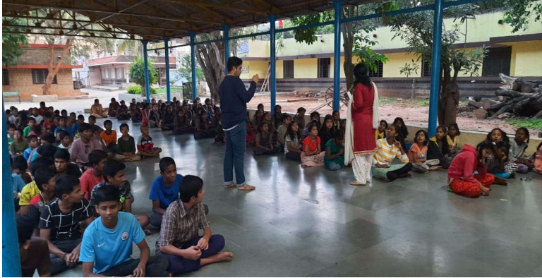
Importance of cleanliness and garbage segregation by Infosys CSR Team on 17 th Dec 2022