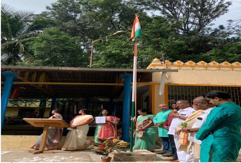
75 th Independence day