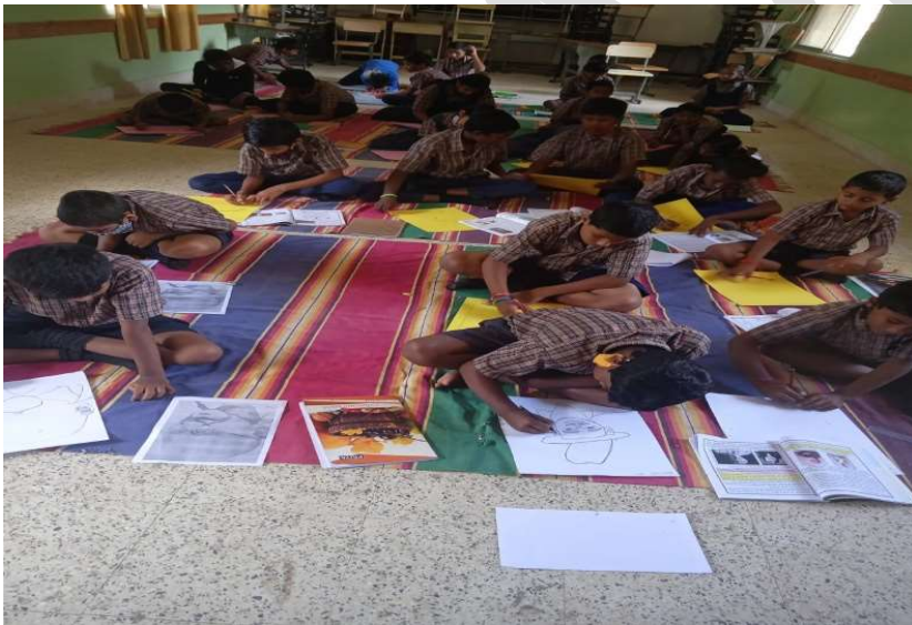
Independence Day themed essay and painting competition.