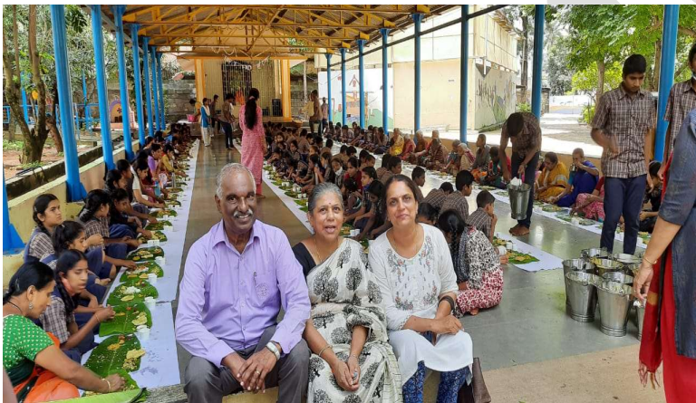
An elaborate Kerala traditional lunch was served to all 300 students and inmates of BGMS