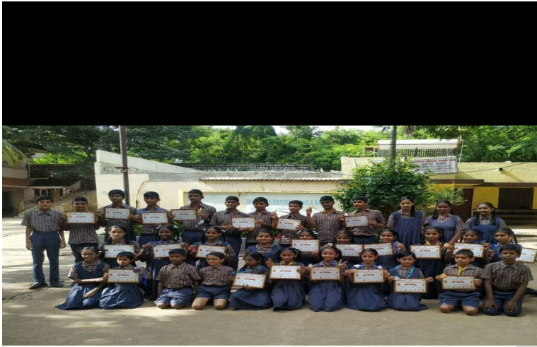
BGMS Children participated in Pratibha Karanje and won many competitions