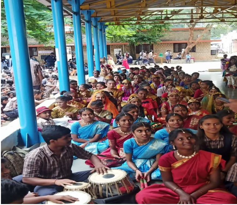
Pratibha Karanjee – Children waiting to showcase their talent