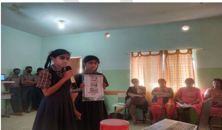
Spoken English class presentation on 5 th Oct 22. Students were evaluated by external Judges.