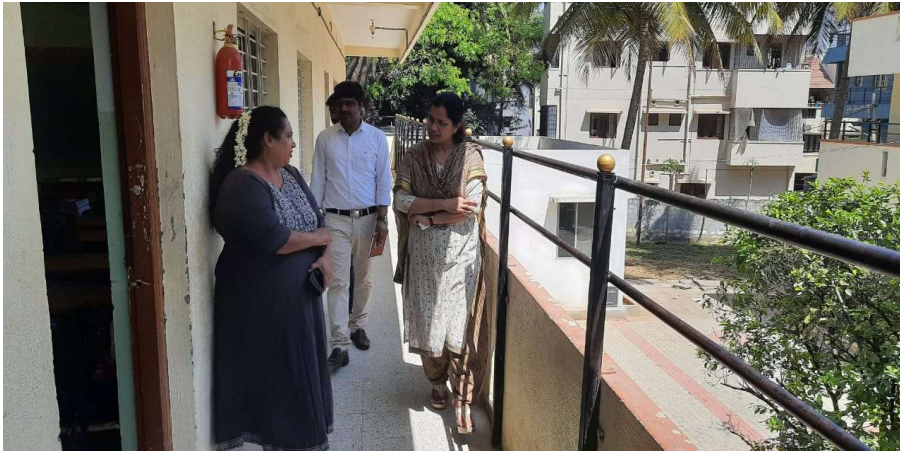
DCPO inspecting Boys and girls hostels and files of children