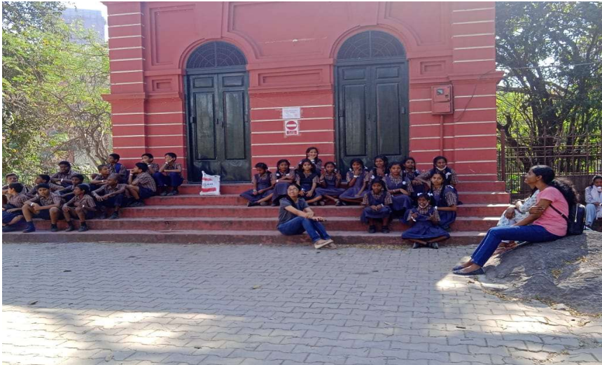
Vishweshwarayya Museum Visit