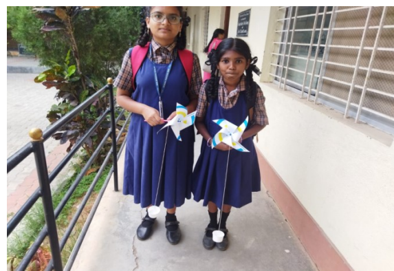
Learning Lab workshop