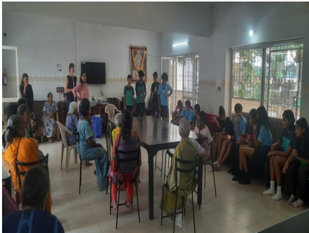
Canadian International School Yelahanka Visited Anadham on 31 May 2023 and interacted with Senior citizens.