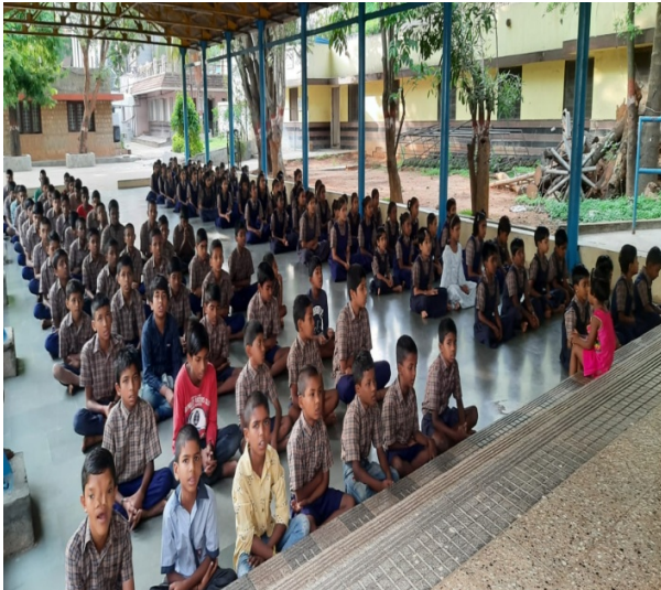
Morning assembly for prayer