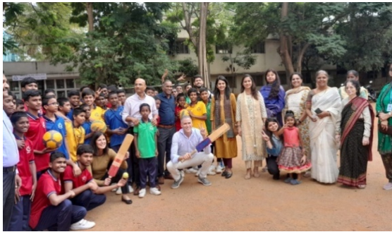
CEO playing Cricket with the Children