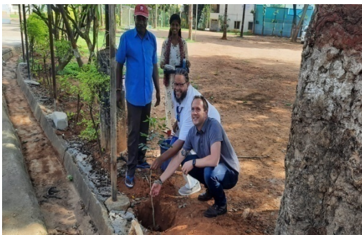
Tree Planting by CSG team