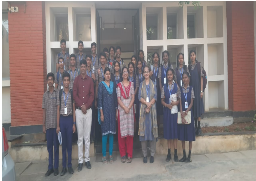
23-24 Batch. 10 th std students 1st day of exam