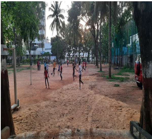
Playtime after school hours