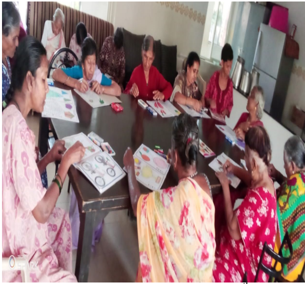
Fun activities to old age home on 13 th Dec by guardians of Dreams