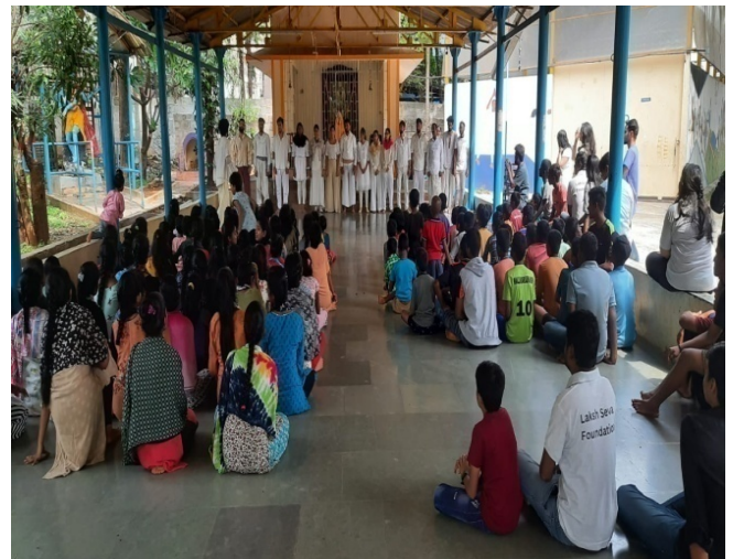
Laksh Foundation conducted games and fun activities for Children on 4 th June and donated stationery