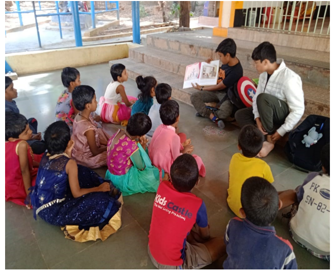
Story telling after school hours by volunteers