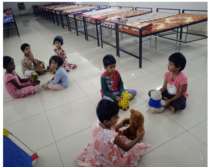
After school playing for young kids