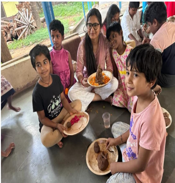
Hands 4society conducted clay modeling workshop for children on 17 th Sep 2023