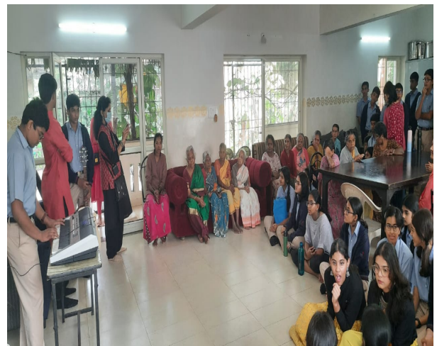
Deens Academy students entertained and spent time with Anadham inmates on 7 th Dec 2023