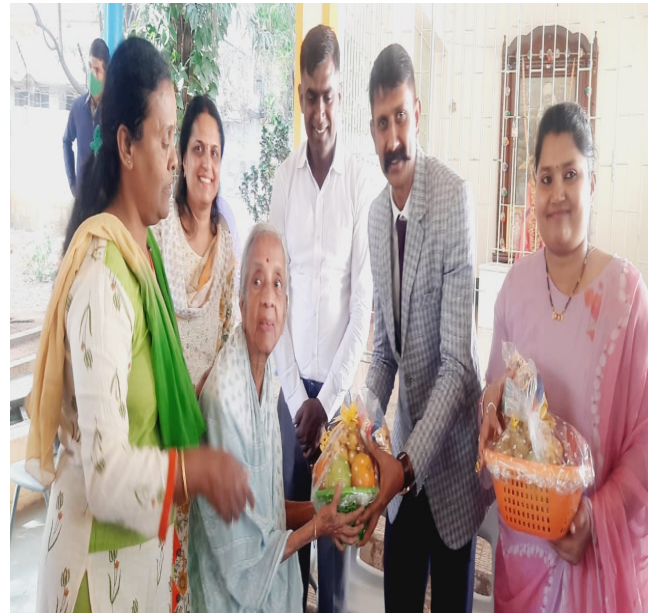
New year with Police, Bangalore east - DCP, ACP and inspectors celebrated new-year with inmates of Anandham