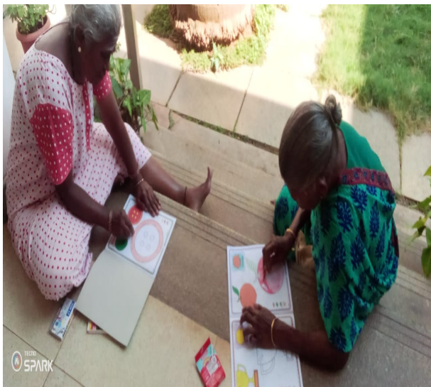
➤ Colouring activity on 13 th Dec 2023