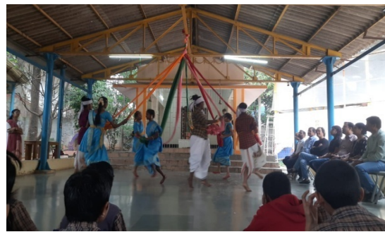
Cultural Program for the visitors