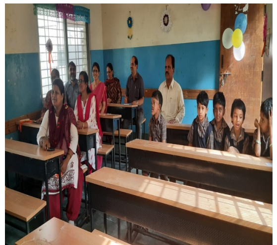
New desks and Benches