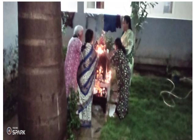
Tulasi Puja on 24 th Nov