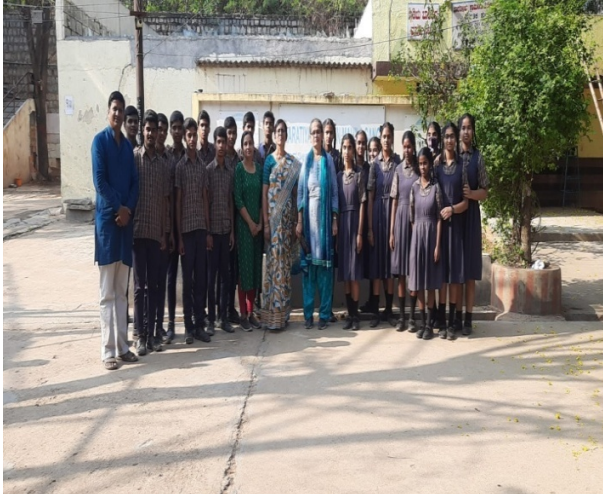
10 th STD students on the day of Exam (22-23 batch)

April 23 started with final exams. Children were sent home after exams for summer break from 15 April to 22 May.