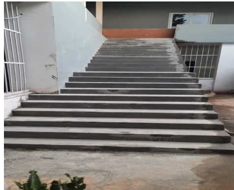
Interlock work near boy's hostel