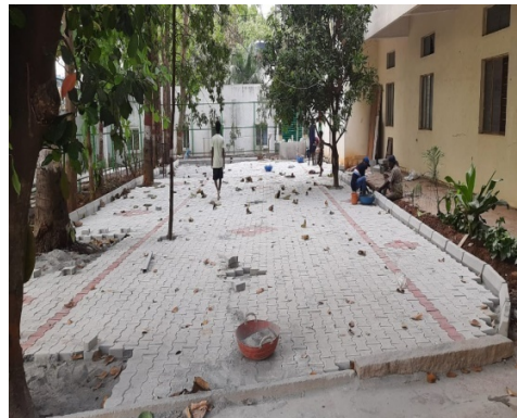
Mallige cottage renovation: Funded by CSG Systems International India Pvt. Ltd