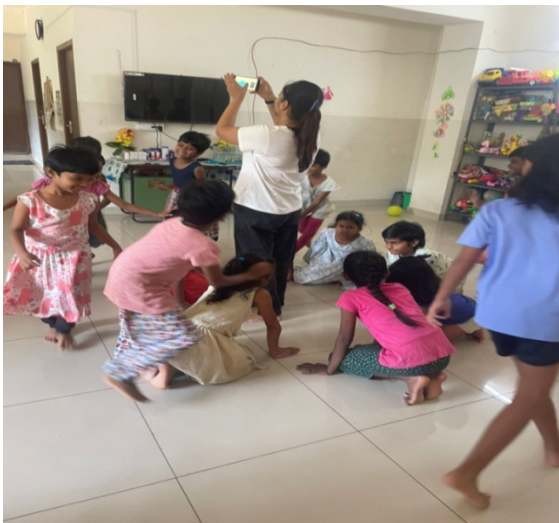
Volunteers from Adarsh Palm Vista Conducted storytelling and fun activities for junior girls every week