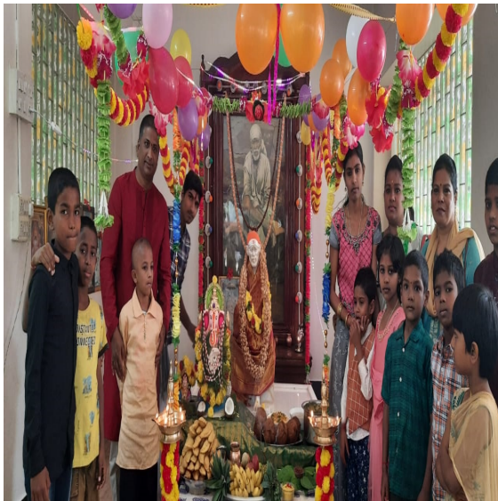
Inmates celebrated Ganesha Festival celebrated on 18 th Sep 2023