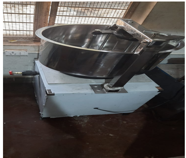
Ragi ball making machine (Mixing for Ragi mudde making)