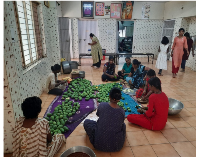
Training to inmates on Pickle making