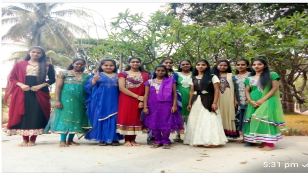
Graduation day 22-23 batch on 15 th April 2023

In the academic year 2022-23, 29 10 th std students wrote board exams from 25 th Mar to 14 th April 23. Results announced on 8 th May 2023. 27 Students out of 29 passed board exams. 5 students passed with distinction with highest score being 93%. 2 Students who failed wrote the supplementary exams in July but they were not able to clear the exams. All 5 students who scored above 80% were given scholarship from Rotary Bangalore Indiranagar under their Vidyadaan program and Guardians of Dreams provided scholarship to another 5 students. BGMS guided students and parents to join different courses and colleges.