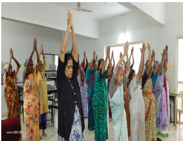
Yoga day on June 5 th 2023